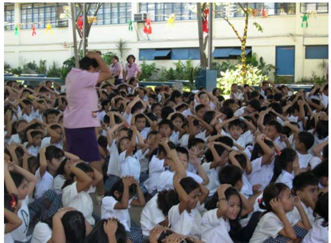
Students perform the "duck, cover and hold".