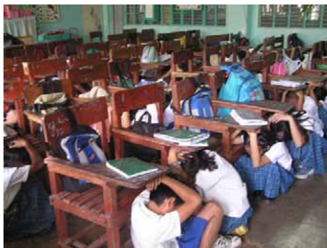
Students perform the duck, cover and hold during the actual drill.