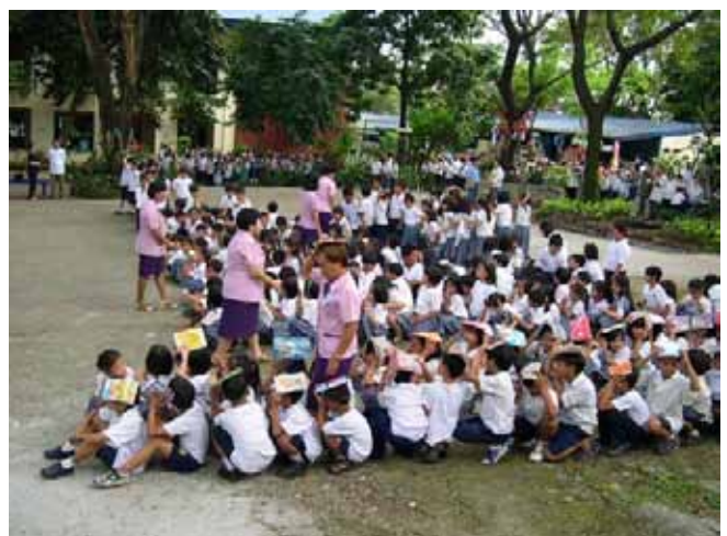
Teachers make a headcount of students at the designated evacuation area.